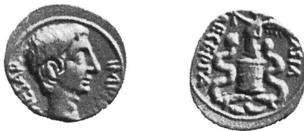
Fig. 3 (2:1)