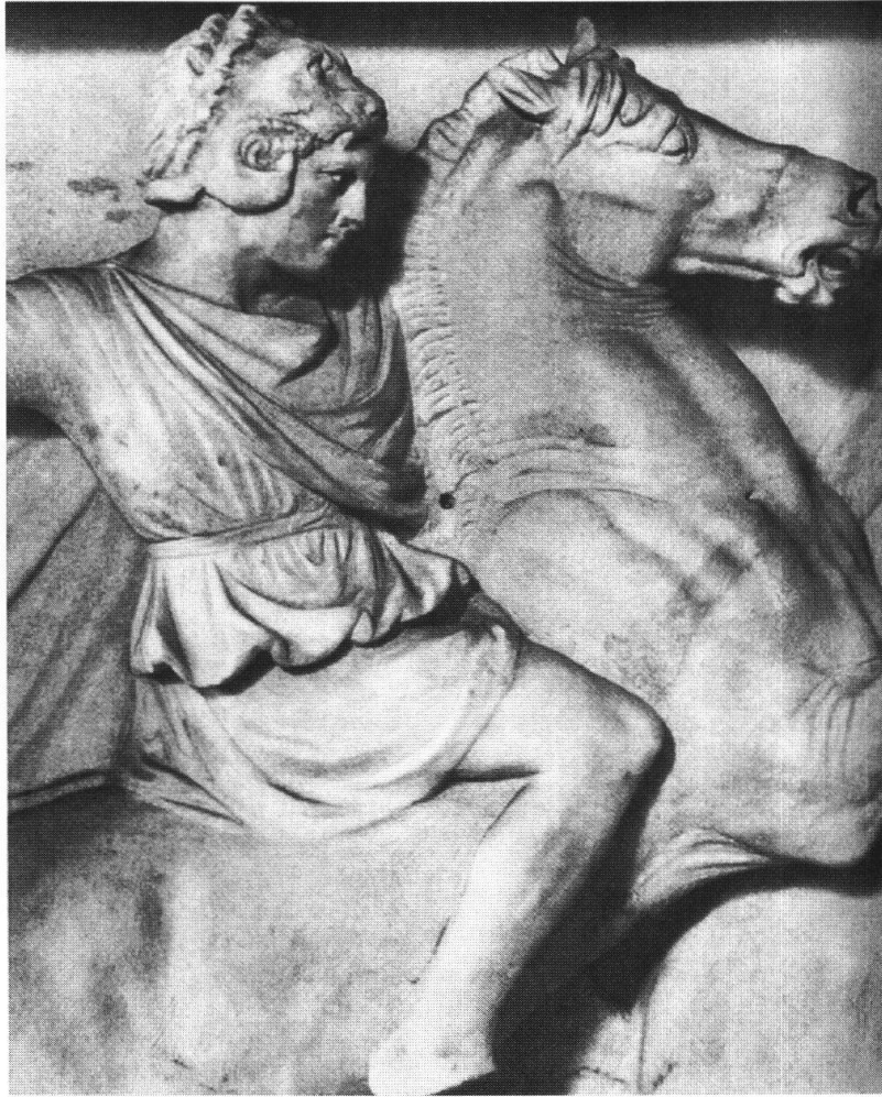
Fig. 1 Alexander in Battle. Alexander Sarcophagus found in Sidon. Istanbul

Unfortunately there is no evidence that in either the Hellenistic or Roman period anyone ever associated bull's horns with representations of Alexander. He never appears horned in art (except with the ram's horns of Ammon), nor is there any mention in the ancient literature of the Macedonian king represented with taurine divine attributes, although he is said to have occasionally worn the attributes of Zeus-Ammon, Heracles, Hermes and even Artemis. 27 Admittedly, arguments e silentio are not compelling, but when it is also considered that ancient authorities emphasize bull's horns as a feature of Seleucus' personal iconography, it seems somewhat perverse to continue to insist that the helmeted head must be Alexander. Indeed, the bull's horns associated with representations of Seleucus seemed so remarkable to ancient writers that they found it necessary to explain