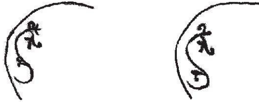
Fig. 1 Helmet palmette of 20α and 22α .

stage. It will be argued that 20α represents the earliest version of the die known so far, according to the development of the die-breaks. At first sight, however, the palmette on Athena's helmet tells the opposite ( fig. 1 ):