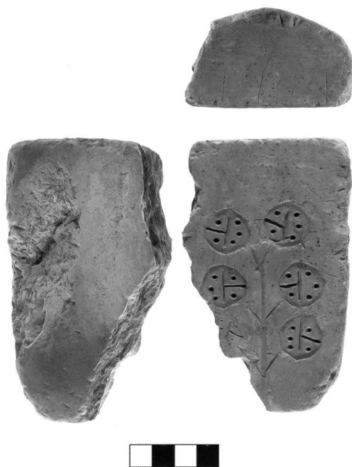
Fig. 2 The mold.