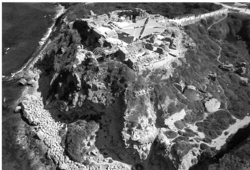
Fig. 1a The castle of Arsuf (Apollonia-Arsuf) – an overview looking northwest (photograph by Or Fialkov, September 2019).

The recent 2018–2020 seasons have concentrated on the castle's western façade, where two floor levels were identified and the location and remains of a chapel, reflecting the two periods of construction in the castle's history, that of the Ibelins (1240s) and that of the Hospitallers (1260s). 9 As it stands, the castle's western façade consists of three halls, a central one and a northern one that by now are fully excavated, and a southern one to be excavated in the future ( Fig. 1 ). The central hall was likely a connecting hall (at least in its Hospitaller stage) between the inner parts of the castle and the seashore as is evident from an opening with a marble-made threshold in its south-western corner leading to an outer ramp that probably led from the hall down to the coast. The northern hall was likely a stable and a working area (at least in its Hospitaller stage) as is evident from several troughs, tying stones and plastered floors, walls and sewage channels. The small finds include ceramics, mainly thirteenth-century pottery forms, glass vessels and windows (both grisaille and stained glass), and several coins. During the Mamluk siege these halls underwent additional changes and were afterwards looted for their building stones. Both the mold and token discussed here came from destruction fills in the western façade central hall dated to 1265.