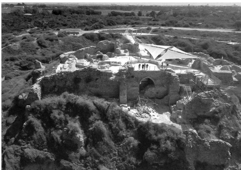
Fig. 1b Aerial view of the western façade, looking east (photograph by Or Fialkov, September 2019).