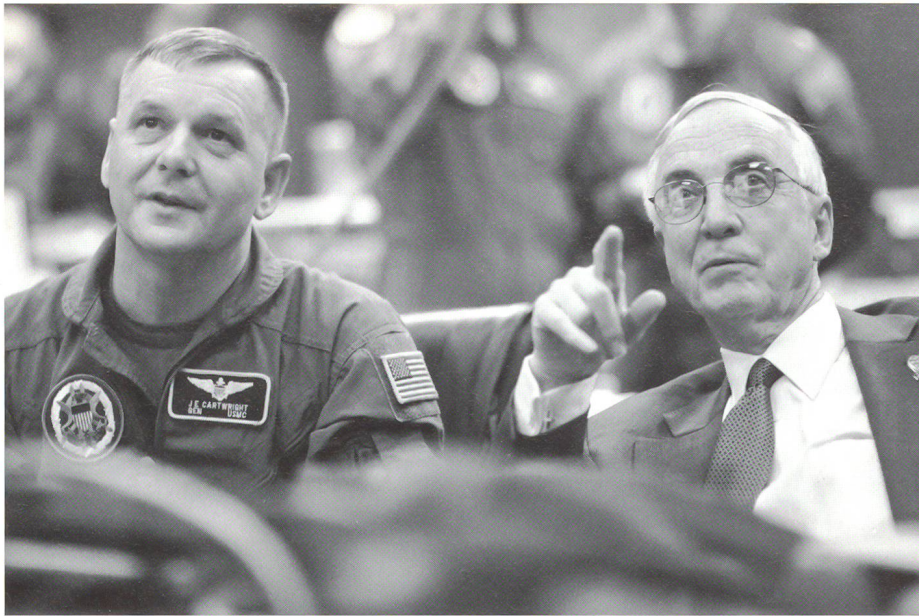
Deputy Secretary of Defense Gordon England (right) and Marine General James E. Cartwright, Vice-Chairman Joint Chiefs of Staff, watch the successful kill of a satellite from the Command Center at the Pentagon in February 2008. The Standard sea-to-air missile SM-3 was fired from the cruiser USS Lake Erie.

Maritime forces from the United States Navy and Coast Guard (such as these vessels in Bahrain), together with forces from the UK, Australia, France, Pakistan, Germany and others, control the Persian Gulf in order to protect Iraqi oil terminals from terrorist attacks.