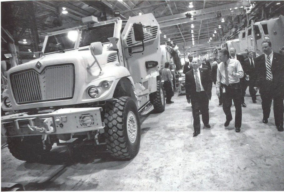
The US armed forces often suffer heavy casualties from mine blasts in Iraq. To reduce the risks during life threatening patrols, the Army is now deploying the new vehicle MRAP which offers much better protection to the crew.

ing that China increasingly comes to share Western values embodied in the Enlightenment, certainly for the foreseeable future China is not close to seeking, accepting or receiving the mantle of global leadership on security matters. Its pretensions to global military power remain mostly external interpretations of where China may be heading in the future rather than any declared aspiration on the part of the Chinese Communist Party. China's meteoric rise since Deng Xiaoping opened up China in 1978 has produced impressive economic growth, but progress has also exposed a host of domestic threats from environmental, social, and political causes.