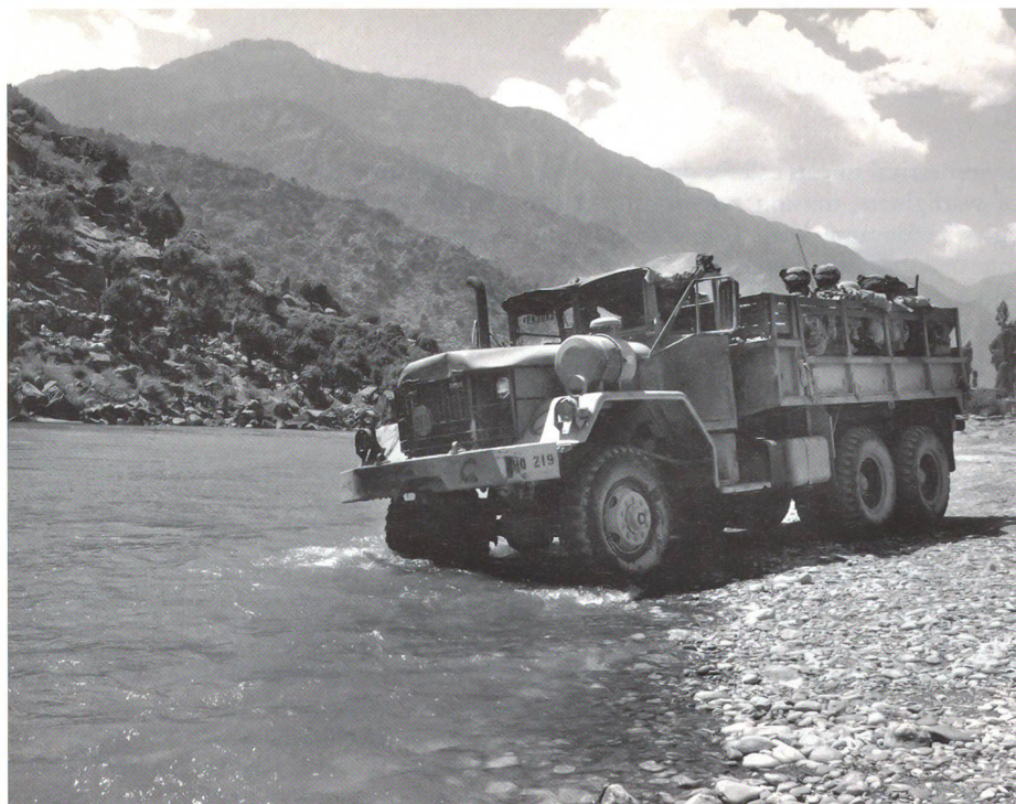
A short time after 9/11 the United States sent military forces into Afghanistan to fight at one source of terrorism. Here members of C Company, 1st/32 Battalion, 10th Mountain Division are crossing the Pech River during a mission in Afghanistan.