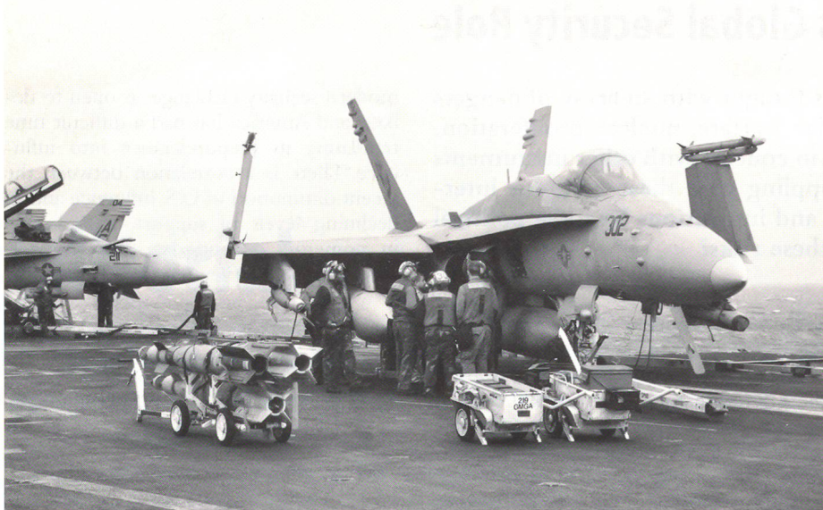
Aircraft carriers are important assets in the United State's global security role. This F/A-18 C of Strike Fighter Squadron 37 belongs to the carrier USS Harry S. Truman currently conducting maritime security operations in the Persian Gulf.