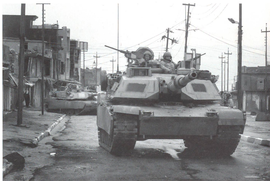
An M1-A1 Abrams tank of the 3rd Armoured Cavalry Regiment moves through the streets of Mosul, Iraq. As part of their global commitment, the United States invaded the country in 2003 to free its population from Saddam Hussein's regime.

of the burden the United States is shouldering, political will – Sarkozy notwithstanding – is lagging behind. The German Marshall Fund survey quoted above shows 88 percent of Europeans want the EU to assume more responsibility for tackling global threats. But those questioned expressed most support for more EU spending on development aid, not military measures. The depth of criticism over the military intervention in Iraq masks the fact that European political will to undertake even more “legitimate” military operations – such as combat operations against the