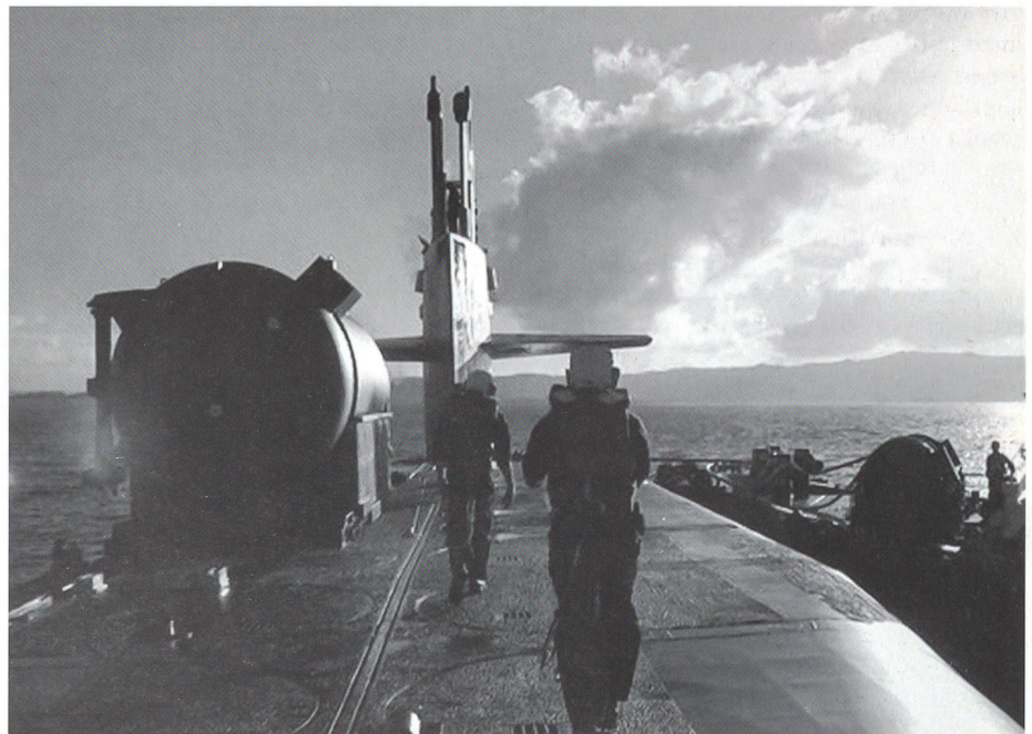
Four former strategic ballistic missile submarines of the Ohio-class were recently converted to cruise-missile and Special Operation Forces carriers. They each have 154 Tomahawk cruise missiles aboard and thus offer a unique strike power to the operational U.S. commanders worldwide.