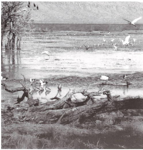
Nebst den Vögeln leben hier auch Krokodile...