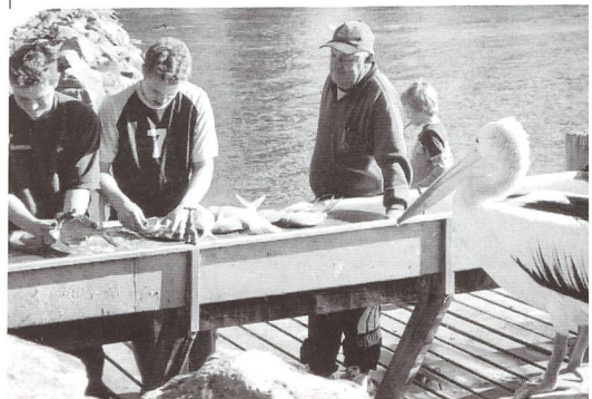
Die Pelikane haben offenbar Hunger