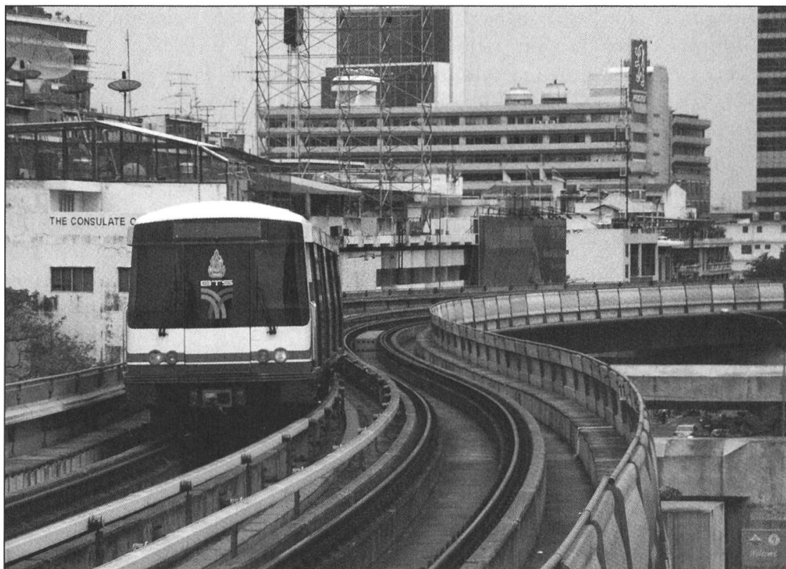
Rot-Fai-Fah – the “Car with Fire up in The Air”

In the early months of the Sky Train operations were about 150.000 passengers against the needed 600.000 (Hoskins, 2000, 51), whereas the estimate of the current daily user figures is between 380.000 and 400.000 (Vichiensan and Miyamoto, 2006, 3; Perera, 2006, 11). The passenger shortfall reflects the limited routes and a failure of bus companies to operate feeder services to the Sky Train. As a consequence of the different ownerships and control of Bangkok infrastructure, the Sky Train was perceived more as a competitor than a complementary infrastructure by the bus operators. This is a reflection of the overlapping spaces of flows and jurisdictions. As the Sky Train has now existed for 7 years there has been a shift in both the public perception of the train as well as in the number of passengers travelling on the Sky Train. Furthermore, the gap in price between the train and the (air-conditioned) busses is decreasing. All in all making local policy analysts conclude that the Sky Train has come closer to the hearts and habits of Bangkok’s middle class (Personal interview with Professor, Dr. Charas Suwanmala, Chulalongkorn University). However, the poor people and the immigrant workers still cannot afford the ticket price for the Sky Train.