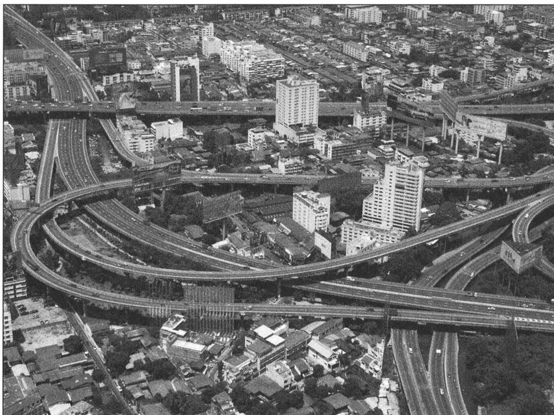
Bangkok – City of Layers

Bangkok Metropolitan Region covers 56,875 sq. km with an urbanised area of approx. 700 sq. km (Department of City Planning, 2004, 31). In the Metro-