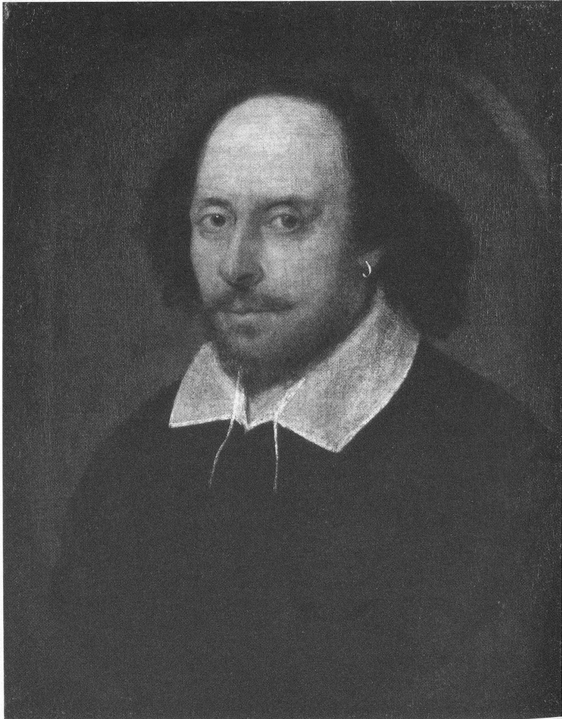
Figure 3: Attributed to John Taylor. William Shakespeare? , known as the Chandos portrait. c. 1600-10, oil on canvas, NPG 1.