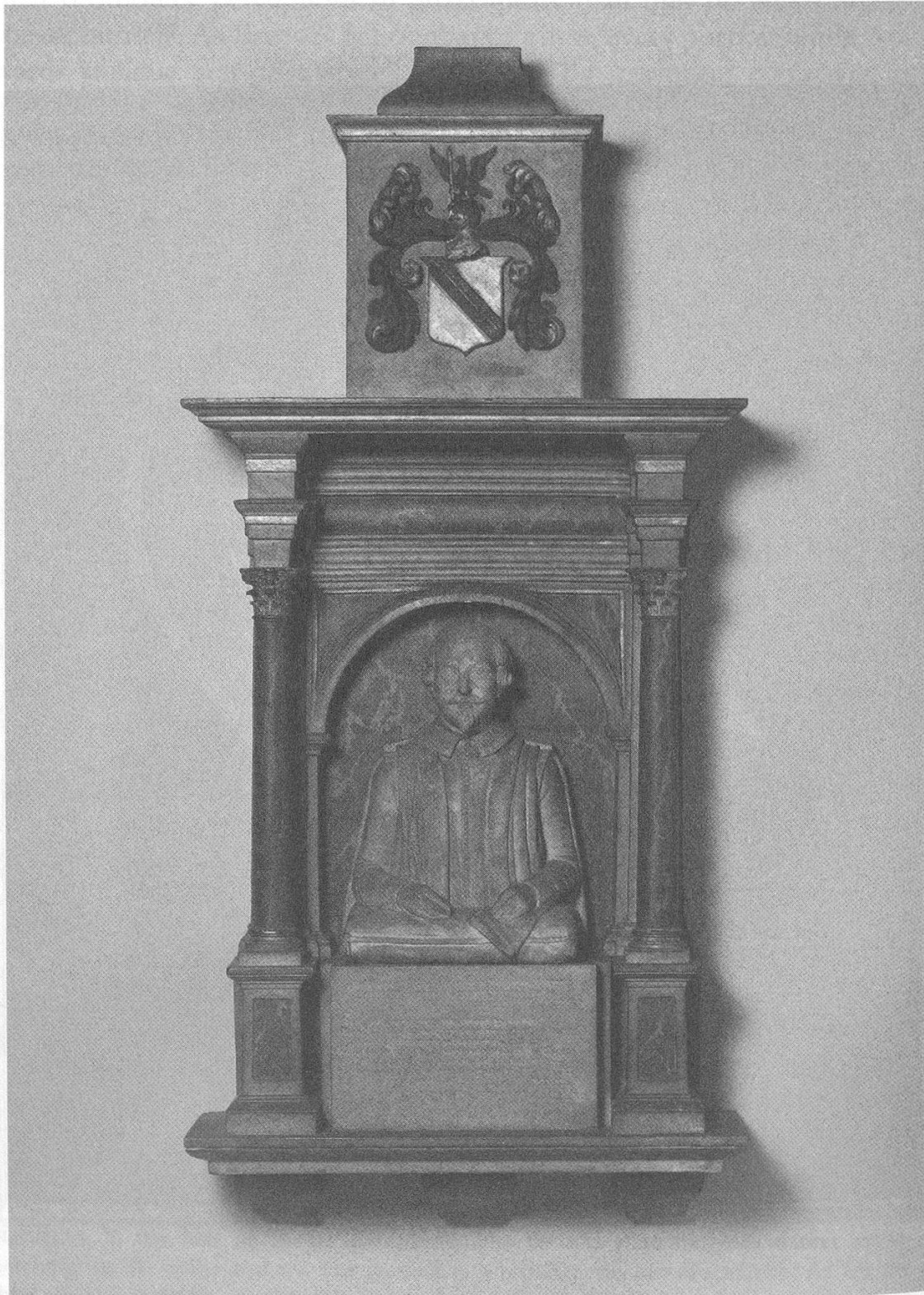
Figure 2: After Gheerart Janssen the Younger. Plaster cast of William Shakespeare's effigy in Holy Trinity Church, Stratford-upon-Avon. c. 1620, plaster, NPG 1281.