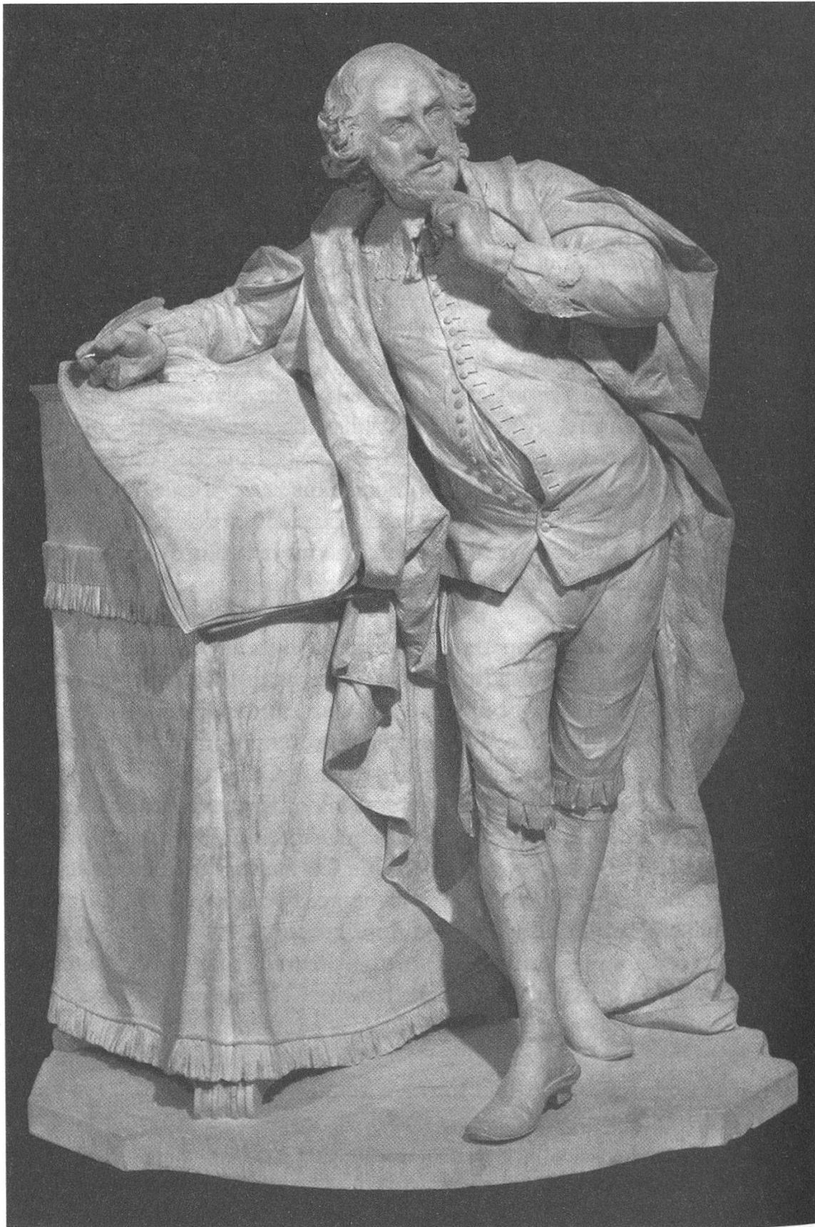
Figure 4: Louis-François Roubiliac. William Shakespeare . 1758, marble, M&M 1823, 1-1, 1.