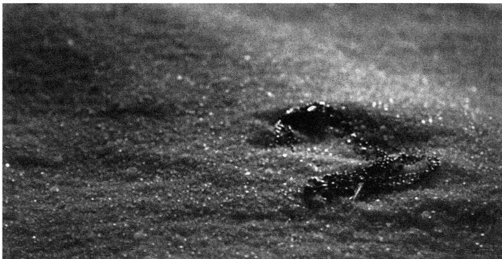
Figure 3: Quantum of Solace (digital frame enlargement)

an ironic statement. After having hunted down those who forced Vesper Lynd, his lover from Casino Royale , to commit suicide, Bond is finally able to return to duty. In the last exchange of dialogue, M says to Bond, “I need you back,” and he answers, “I never left.” As if to prove his professionalism, he drops the deceased Vesper’s necklace into the snow. As a visual equivalent to Fleming’s line “The bitch is dead,” this gesture is meant to be read as Bond finally overcoming all the painful emotional attachments of the past. Traumatic loss is simply shrugged off, literally dropped. Once again, Bond escapes into action and reverts to being a successful “blunt instrument” - unhindered by any twitch of neurosis. Yet, the escape is futile, and the final image tells us so (Figure 3). In the close up of the snow with its tiny crystals of ice, we find the fractured and pixilated visuals of the new media once again, re-routed. What we see is nothing other than digital noise, commonly referred to as “snow.” Bond dodges internal psychic conflict only to be engulfed by an even more conflicted war zone. His escape from personal neurosis has led him right into the neurosis of the world.