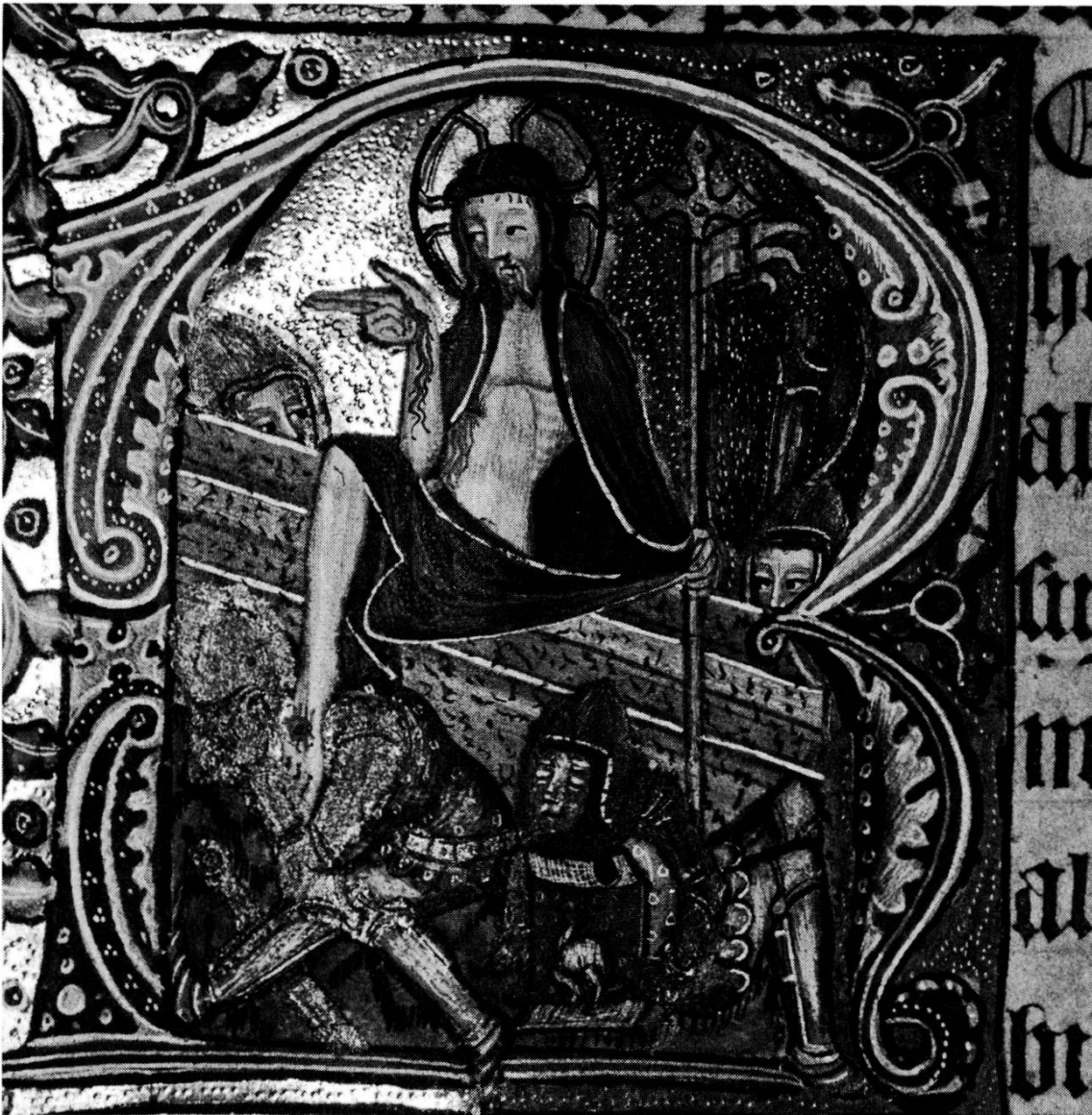
Figure 3: Litlyngton Missal, Westminster Abbey MS 37, 1383-1384, fol. 95v