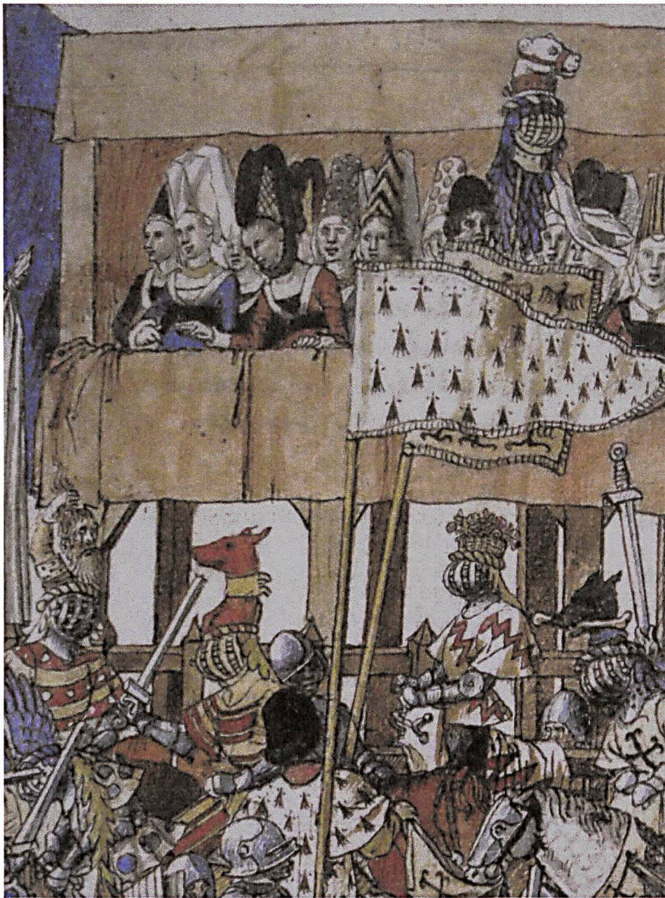
Figure 8: Edmund of Arundel, Count of Salisbury and the Countess, Salisbury Roll A, London, British Library, MS Add. 45133, fol.55r

century Salisbury Roll. It shows the Duke and Duchess of Salisbury with their ensign, a golden lion on a red background and trimmed in black, painted on his armour, sculpted on his helmet crest, and sewn on her