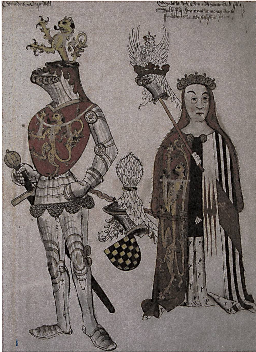
Figure 9: Knights in tournament equipment, detail, pen and watercolour drawing, French, 15th century, René d'Anjou, Le livre des tournois , Paris, Bibliothèque Nationale, MS 2695, fols.100 v -101 r . Reproduced by kind permission.

the dead knight and his equipment that is solicited by these images. Medieval churches, one of whose roles was to be what Keen calls “the mausolea of chivalry” (178) were commonly draped with the banners and insignia of the nobility who were buried or memorialised there. 54