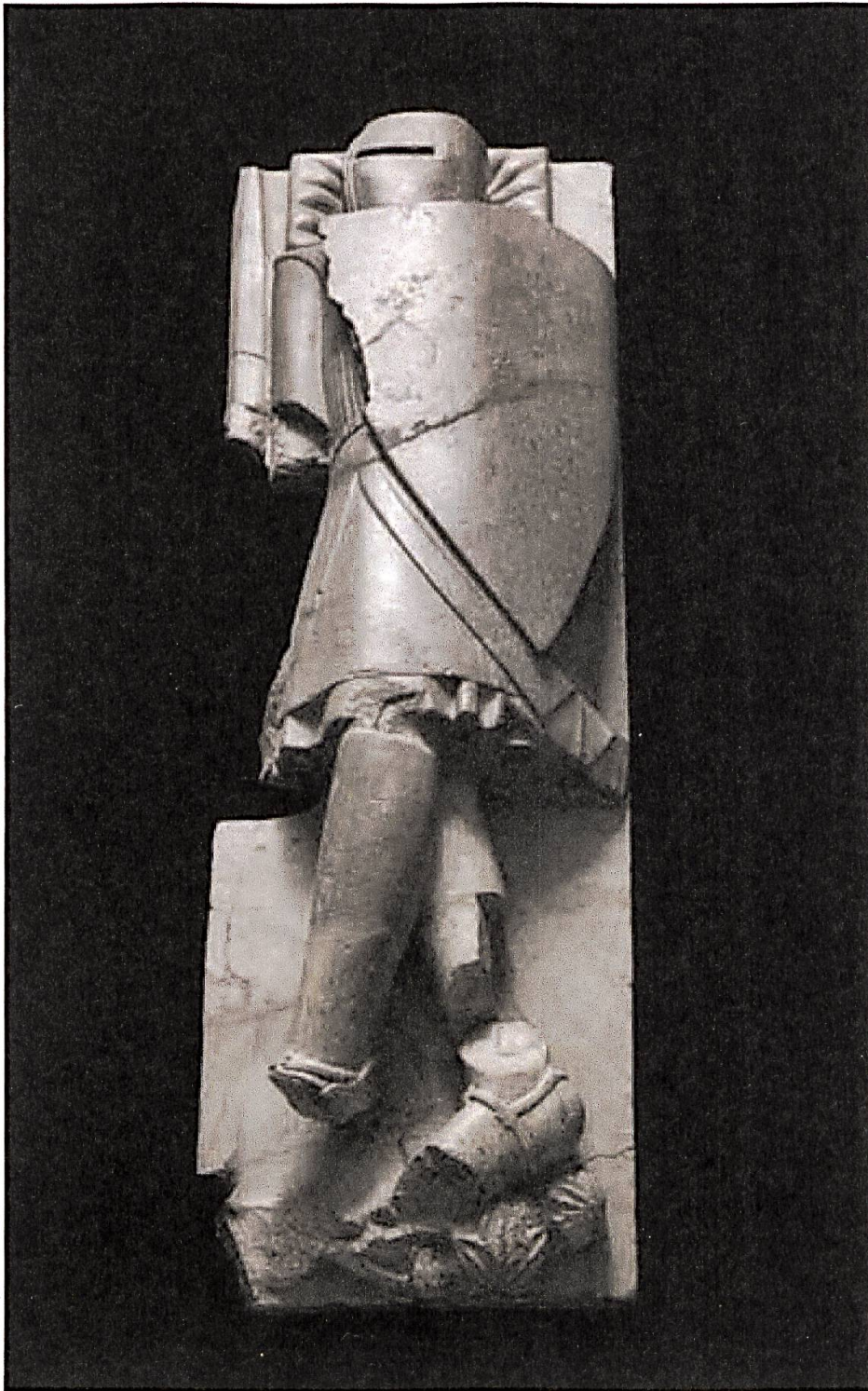
Figure 7: Armoured knight effigy, Urswick limestone, English, 1250-75, Furness Abbey, Lancashire. Reproduced by kind permission.

chivalric insignia appeared on shields, tunics, ceremonial helmets, flags and horse coverings, not to mention their replication in images, sculptures and on tombs. Figure 8 comes from the “A” copy of the fifteenth