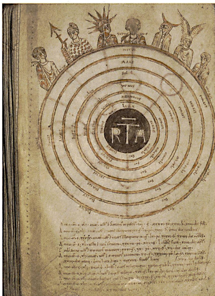
Figure 5: The Planets and their spheres (left to right, Jupiter, Mars, Sol, Saturn, Luna, Mercury, Venus), pen and ink drawing with colour, (?)Abbey of Beze, Burgundy, first quarter of the 11th century, Tractatus super astronomiam , Dijon, Bibliothèque Municipale, MS 448, fol.63 v . Reproduced by kind permission.

Here in the middle on the left Jupiter sits on his throne; Mars appears below in his chariot, accompanied by a wolf, with Pavor (Fear) looking back at him; the earth goddess Cybele is above; in the centre in his chariot is Apollo, and on the right the ubiquitous Saturn, holding a serpent with its tail in its mouth and a scythe. 29 Each of these gods, as in so many mythographical and astrological texts, has his or her own headgear and identifying equipment; this can be seen in Dijon Bibliothèque Municipale MS 448, fol.63 v (Figure 5).