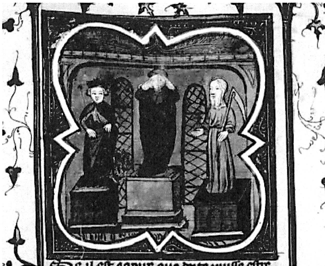
Figure 3: Jupiter, Janus and Saturn on individual altars, manuscript illumination, French, 14th century, Augustine, City of God , trans. Raoul de Presles, Paris, Bibliothèque Nationale, MS fr. 6271, fol.114v. Reproduced by kind permission.

as in Figure 1, these idols look at their worshipers, participating in mutual gaze of seeming fascination. On the left of Figure 2, however, we also see theatrical representations of the gods – ridiculed at length in the second book of Augustine’s City of God . With their exotic headgear and other identifying markers, these appear to be, from left to right, Jupiter, Janus and Saturn (with a small scythe). 26 This trio is clearer in Figure 3, where each god has his own plinth.