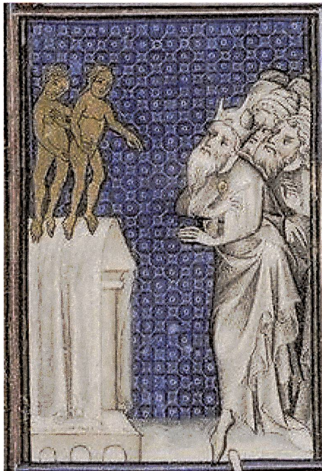
Figure 1: Pagan Worship, detail of manuscript illumination, French, 1375-77, Augustine, City of God , trans. Raoul de Presles, Paris, Bibliothèque Nationale, MS fr. 22912, fol.2v. Reproduced by kind permission.

be the “wood or stone” of an image or its beautiful painting. 22 Chaucer may also invoke some combination of these ideas when the narrator of the Knight’s Tale says of the artist of Diana’s temple that “Wel koude he peynten lifly that it wroghte; / With many a floryn he the hewes boghte” (2087-8). With varying degrees of tentativeness, art historians have considered the possibility that the avoidance of colour in some later medieval art (such as the northern European fashion for leaving religious wooden sculpture unpainted) might be one response to a concern about idolatry. 23