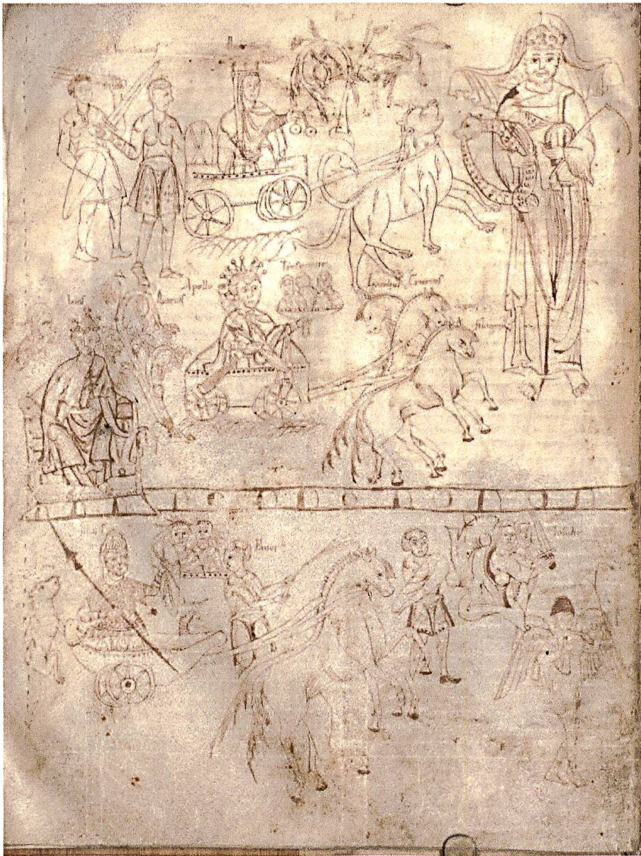
Figure 4: Pagan gods, pen and ink drawing, south German, late 11th/early 12th century, glossed Martianus Capella, De nuptiis Philologiae et Mercurii , Munich, Bayerische Staatsbibliothek, MS Clm. 14271, fol.11 r . Reproduced by kind permission.

ines (“pictures”) of the gods or comment that a god pingitur (“is painted”) in such and such a way; 28 although some modern readers have hypothesised that what is being referred to here are primarily imagined and textual “images,” some of the manuscripts do contain images of the gods, such as the late eleventh-century pen and ink illustration to a copy of Martianus Capella’s De nuptiis Philologiae et Mercurii illustrated in Figure 4.