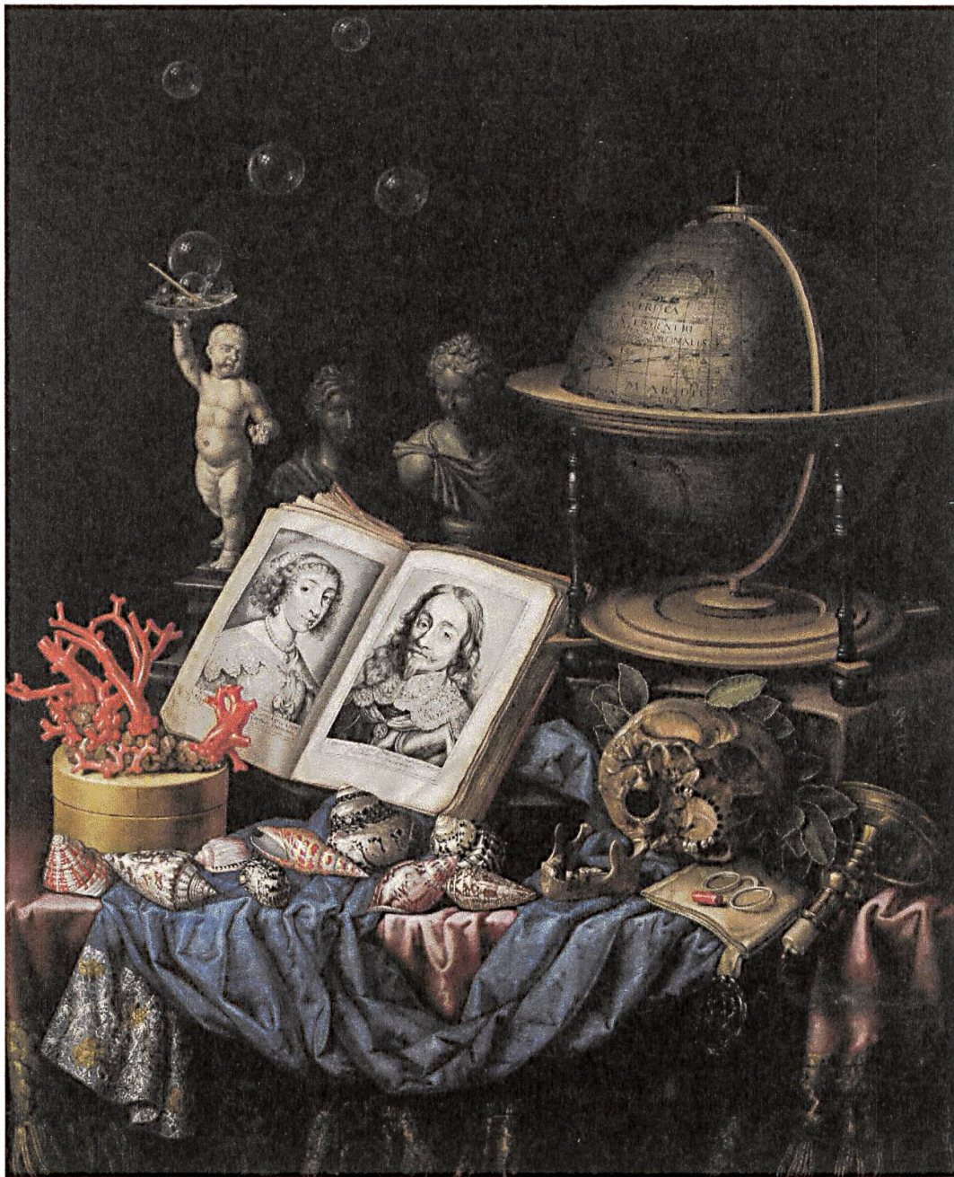
Figure 1: Carstian Luyckx (1623-c.1675), Allegory of Charles I of England and Henrietta of France in a Vanitas Still Life , oil on canvas, 57½ x 47¼ in. (146.1 x 120 cm). Birmingham Museum of Art, inv. no. 1988.28.

The execution of King Charles I of England on 30 January 1649 struck a powerful blow, at home and abroad, against a political establishment predicated upon the divine right of kings. For royalists in England, as for the European ruling classes, it was profoundly shocking – in a way that rocked their whole sense of world order – that a king, anointed by God, could be thus struck down. The profound mark that this event left