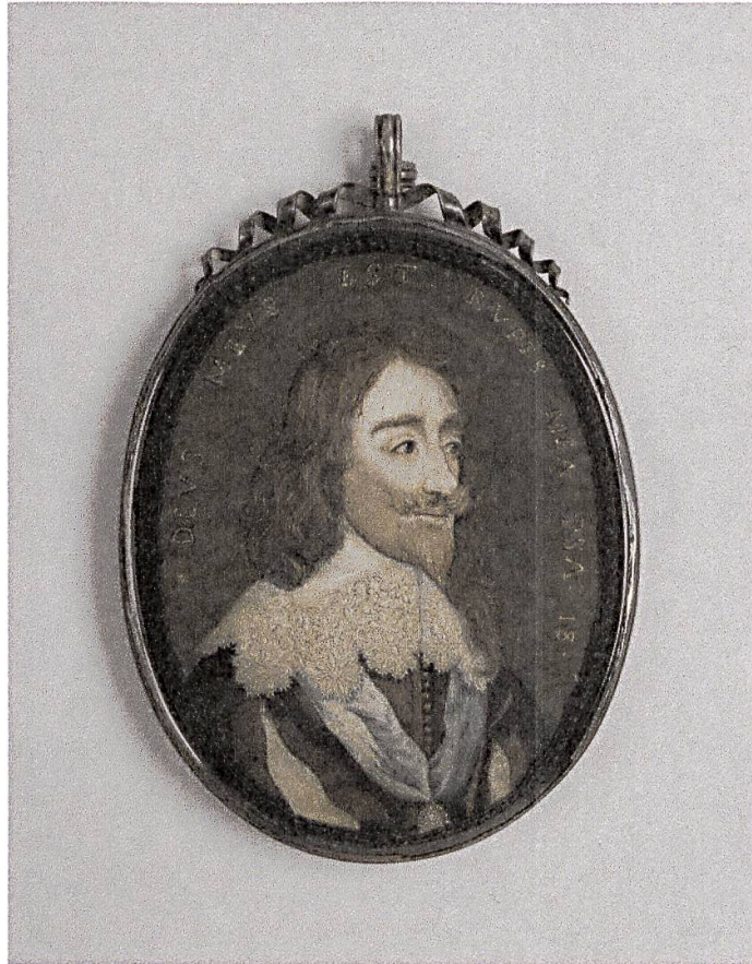
Figure 7: Portrait Miniature of Charles I, English, ca. 1650-70, satin worked with silk and metal thread, 6¼ x 4½ in. (15.9 x 11.4 cm), Metropolitan Museum of Art, inv. no. 39.13.7.

The intimacy offered by the Eikon 's textual portrait was replicated in a number of small-scale commemorative portraits that were made after the King's execution and on into the Restoration era. One example, the size of a limned portrait miniature, is actually made of embroidery of an extremely professional quality (Figure 7). A number of surviving versions of this pattern suggest some kind of commercial, serial manufacture. The model for the portrait is the engraved likeness from the Eikon Basilike and the link with the cult of the martyr is made further explicit by the embroidered inscription, a quotation from Psalm 18, which thus associates Charles with King David by putting the words of the psalmist into Charles's mouth: "Deus meus est Rypis mea Psa: 18." The reference is to Psalm 18: 2-3, which invokes God's protection against his enemies: