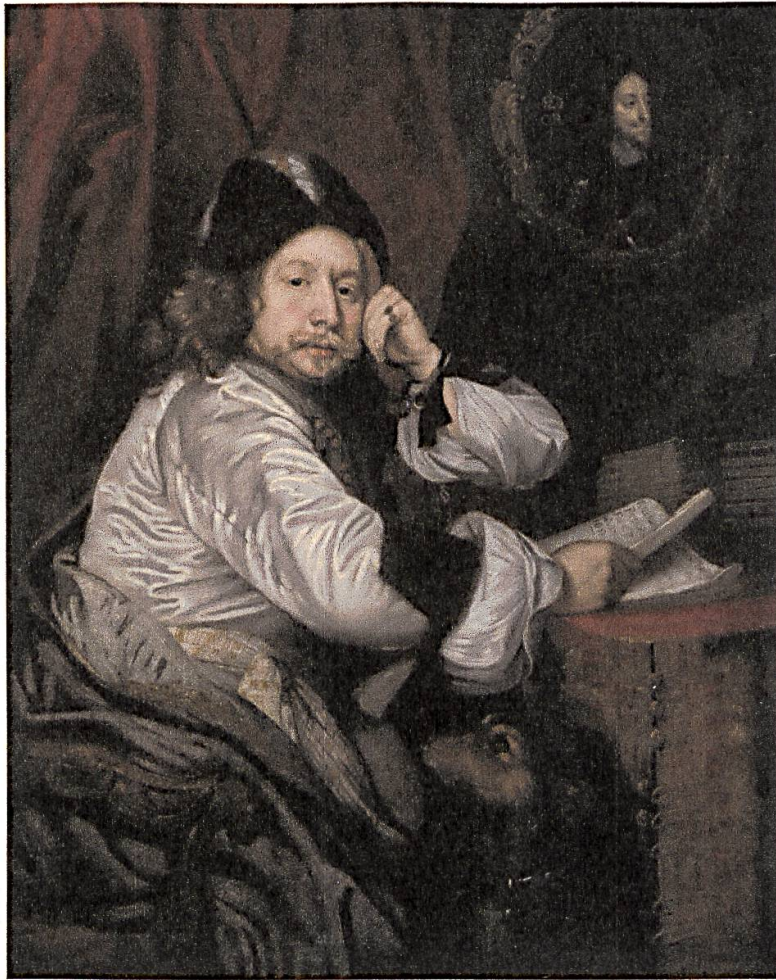
Figure 3: William Shephard, Portrait of Thomas Killigrew, 1650, oil on canvas, 49 x 38 in. (1245 x 965 mm), National Portrait Gallery, inv. no. NPG 3795. (Photo: © National Portrait Gallery, London). Reproduced by kind permission.

to Charles I (Potter 241-42). These included images of the king concealed in rings or locketts, portrait miniatures or anamorphic portraits which resolved into a face only when seen reflected in a silver tube: works in other words that seem to have been designed for concealment and secret use. It seems that, even for the communities of royalists in exile, grief for the king was essentially a private experience. A portrait of the playwright and theatre manager, Thomas Killigrew, painted by William Shephard one year after the king's execution when Killigrew was in Venice as the political agent of the exiled Charles II (Figure 3), shows him in the traditional pose of the melancholic, sitting before a portrait of Charles on the wall behind, while on his desk, a copy of the Eikon Basilike , the purported collection of the king's own writings and favourite psalms and prayers, supports a pile of his own plays. Of course, this portrait makes a very public statement about Killigrew's private devotion