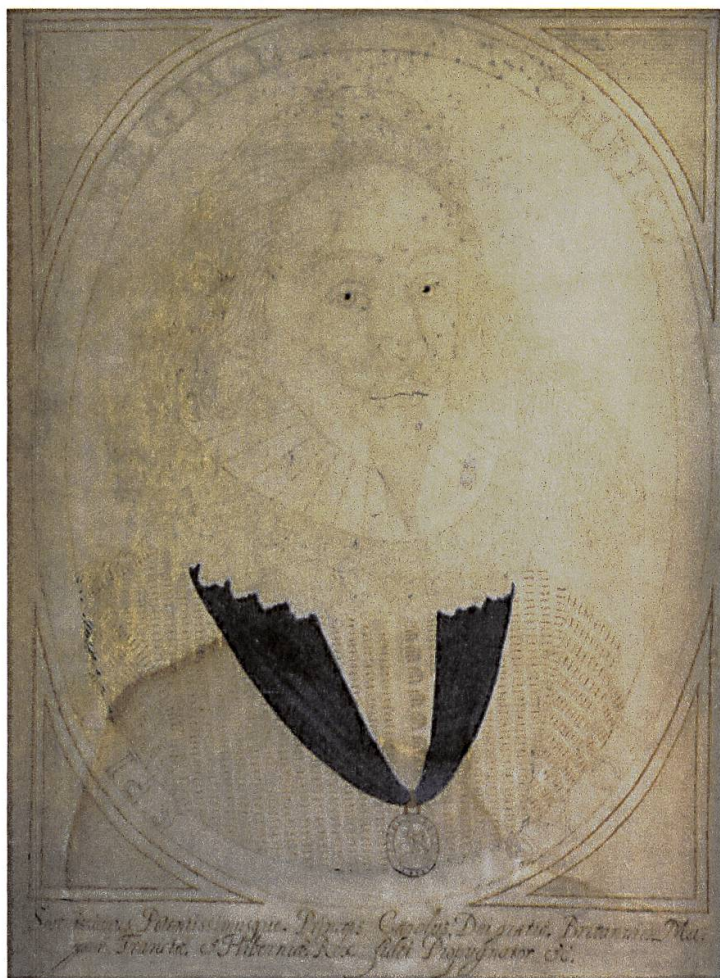
Figure 4: Anon., Portrait of King Charles I of England, brown ink and metalpoint on parchment (with blue pigment and shell gold). St. John's College, Oxford. (Reproduced by permission of the President and Fellows of St. John's College, Oxford).

to his late monarch; indeed, in the 1660s, after the Restoration, it was engraved and even pasted as the frontispiece into at least one of his publications (Killigrew). Yet however much a show of private grief could become a public testament of loyalty, it surely reflects the kinds of private devotion that attached to the cult of the martyred king and which stimulated the production of small-scale portraits, miniatures, and other intimate kinds of memorial art.