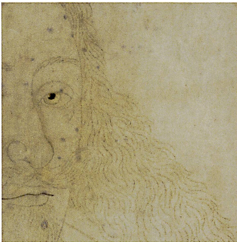
Figure 5: Anon., Portrait of King Charles I of England, brown ink and metalpoint on parchment, blue pigment and shell gold. St. John's College, Oxford. Detail of the lines of face and hair.

drawing. 3 John Evelyn, who visited the college library in July 1654, mentioned several of the college's curiosities, but not the portrait (Evelyn, Diary 3, 108). 4 The earliest reference to the drawing comes in July 1662, in the journal of the Dutchman William Schellinks, which provides a useful description of its context: