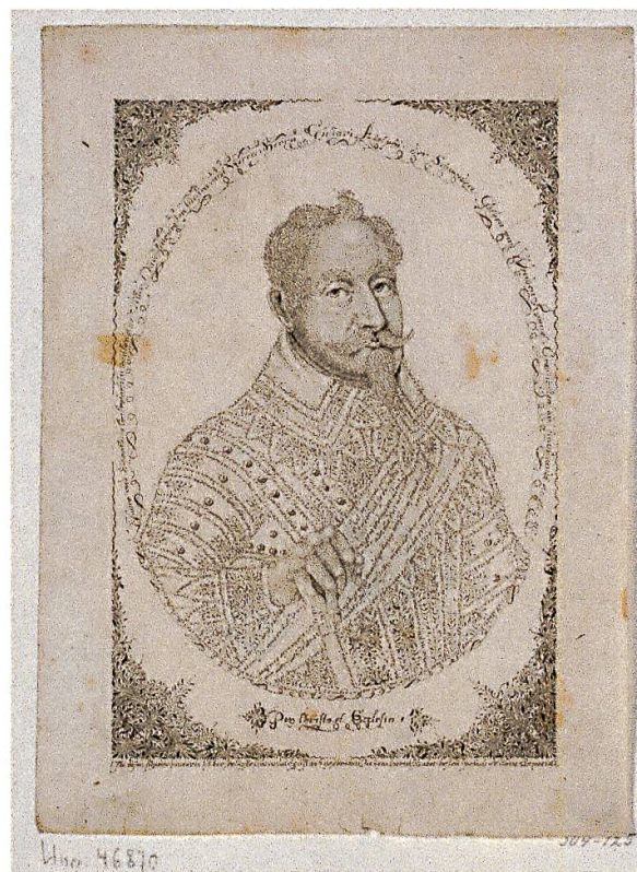
Figure 10: Johann Michael Püchler the Younger, Micrographic Portrait of Gustavus Adolfus, King of Sweden, engraving, 20 x 14.7 cm, Berlin, Kupferstichkabinett, Staatliche Museen zu Berlin, Inv. No. 304-125. (Photo © bpk / Kupferstichkabinett, SMB / Volker-H. Schneider/Art Resource, NY). Reproduced by kind permission.

Wells's "enshrined luster" suggests another possible meaning intended in the use of the technique. As Leila Avrin has written of Jewish micrographic images, "the scribe was intent on inducing the cerebral condition of alexia, the inability to read the written words . . . the letters seem to melt before one's eyes" (Sirat and Avrin 51). In the Charles I portrait, too, the letters, even in their original, less faded state, would have been barely legible and, as Wells's poem implies, would have functioned more as a vehicle of mystical identification and contemplation. The physical words, in their illegibility, act as a material signifier of an invisible divinity. The various near-contemporary accounts of the portrait of Charles I