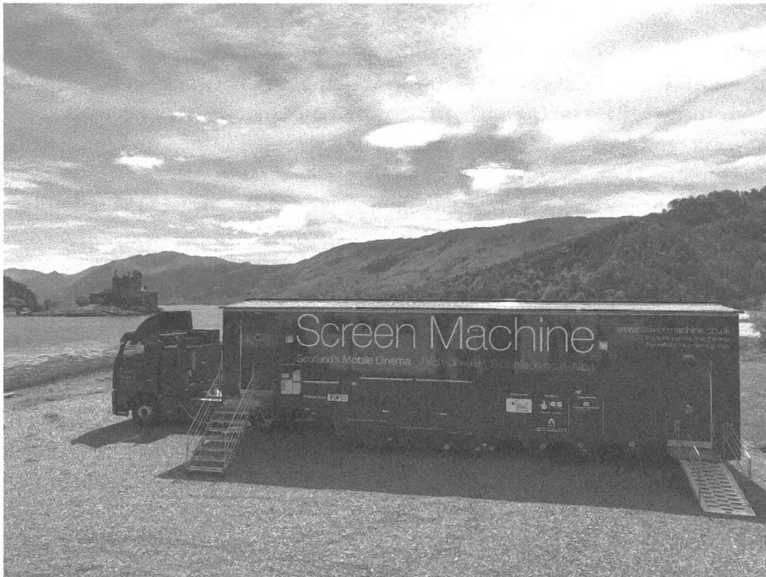
Fig. 3. The Screen Machine in Dornie with Eilean Donan Castle in the background

In 1998 a new version of mobile cinema was unveiled in the form of the Screen Machine, a purpose-built cinema vehicle that promised to deliver the latest films on 35mm to rural areas of the Highlands and Islands of Scotland. The idea of a wholly self-contained mobile cinema that removed the need for spaces that could accommodate a film show originated in France. A partnership of Highlands and Islands Enterprise, the Scottish Film Council and the then Highland Regional Council was formed to adapt and transfer the Cinemobile model from France. The consortium agreed to commission a Highland equivalent of the Cinemobile, financially supported by the National Lottery Fund. A body called HI-Arts was formed to take forward the commissioning process that would eventually lead to the launch of the Screen Machine (Livingston).