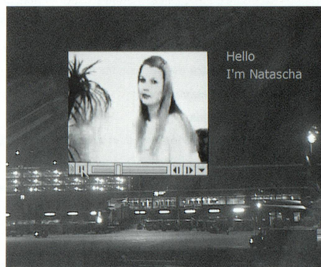
Ursula Biemann, still 3 from WRITING DESIRE