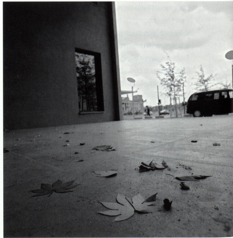
Ein Blatt im Wind , Pippilotti Rist, Installation, Unikat, 2002