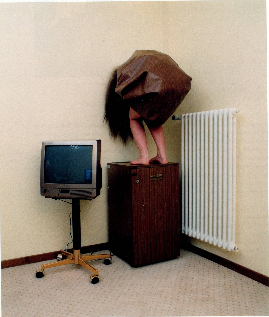
Chantal Michel Der stille Gast Grand Hotel Bürgenstock, 2006 C-Print hinter Plexiglas 120x150 cm