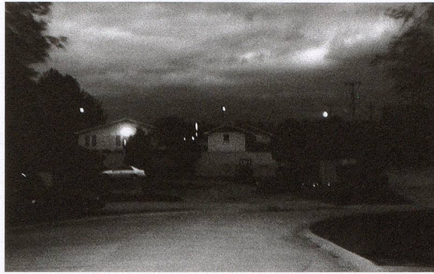
1 from «Day and Night», A book project of phone images, 2011–2013 (in progress), Tennessee

DC: Well, it also depends on what kind of “corporate”. There are a few I often address in writing. Facebook is corporate. I use it heavily. Facebook has never told me I cannot publish a piece of writing because it will turn off advertisers in the audience. The only issue – of “corporatism” – I have with Facebook is I think it should be ran from the bottom up. There is also “global corporatism”. This is linked to the way corporations have hollowed out most governments and have the ability to engage in wide social plans for us, while manipulating us through sophisticated imitations of culture and beyond. And there is a “corporate ethos”. I think of this as something like a symptom of fascism you might find in everyday relations between people or in a society’s domi-