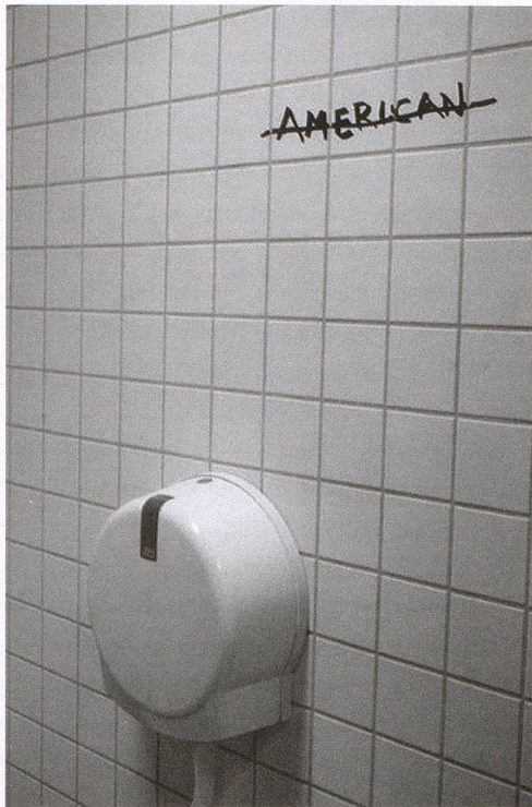
2 «Text» Damien Crisp, 2010