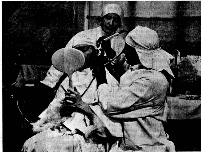
Ultra Modern Plastic Surgery performed with the aid of the Radio Knife. A current of two million vibrations per second passes the needle on the instrument as seen in this photograph which cuts the skin without pain, bleeding or scar.

No amount of massage, slapping, kneading, rolling, exercises, foam and mud baths, applications, creams, lotions, pomades and other appli-