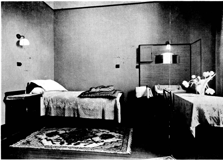
A Single Bed-Room.

houses are old, but I had to marvel at the improvement brought about by the use of modern fittings. The cream scheme of decoration and the bath with polished black slate panels give these bathrooms almost a luxurious appearance.