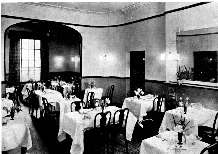
Section view of the Dining Room.

My visit was not quite complete; walking along a passage, a neatly uniformed chambermaid opened the door of a bathroom for my inspection. I have already pointed out that these