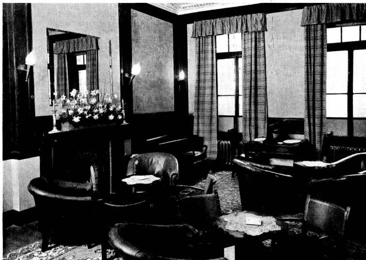
A corner of the Reading and Writing Room.

Casting a glance back over the Lounge on parting from my amiable guide I noticed a general look of contentment on the faces of the guests who were taking their coffee, and this is undoubtedly a proof that they are happy and comfortable at the "Foyer Suisse," I would be happy too, where I to stay there if still a bachelor.