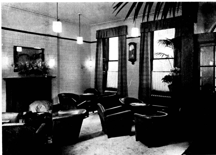
A corner of Lounge Hall.

One is at once struck by the clever and artistic electric light installations, and the way in which the wall-paper, paint and ceiling decorations