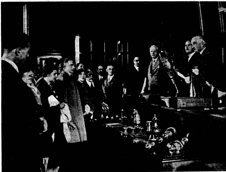
His Worship the Mayor of Cambridge and some of the Staff and Students of the S.M.S. at the Civic Reception in the Council Chamber of the Guildhall.

Unterdessen jagte die Maschine mit einer Geschwindigkeit von rund 300 Kilometern dahin. Von Luftkrankheit oder auch nur von einem beklemmenden Gefühl war keine Rede, so ruhig und stabil lag diese komfortable Kutsche in der Luft. Wir hatten uns auf das vielberühmte Schaukeln so ein ganz kleines bisschen gefürchtet; wir konnten uns indessen nicht genug über die