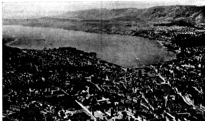
TOWN OF ZURICH WITH LAKE.