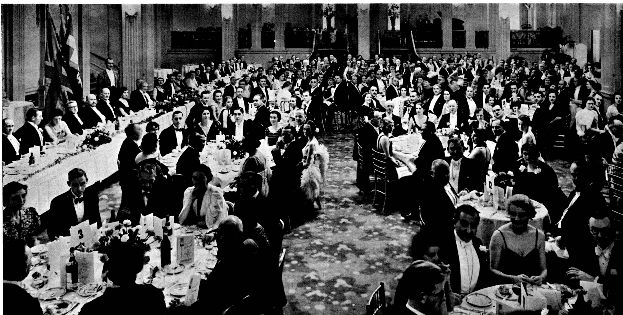
CENTRE VIEW OF THE BANQUETING HALL.

When we consider all the small party and economic quarrels which seem at times to be tearing our country to pieces, we may perhaps wonder whether in the long run we shall be strong enough to fulfil our mission of being a small, democratic League of Nations. But my own personal experiences in recent times have shown me how deeply the democratic sentiment is rooted in our people and how strong is the desire for co-operation and the understanding of our own mission.