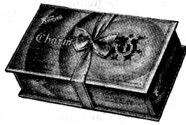
"CHARM" ½lb 2/- 1lb 4/-