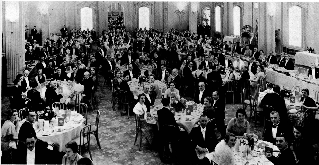
CENTRE VIEW OF THE BANQUETING HALL.

On the contrary, I am going to talk to you about sunshine, and quite a number of bright spots.