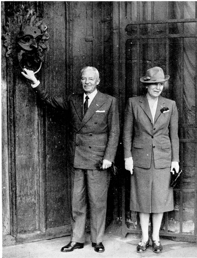
General and Madame Guisan outside Durham Cathedral.

10-ton derricks are fitted at No. 2 hatch and two 5-ton derricks at all other hatches. Three 5-ton and eight 3-ton electric winches will be supplied by Messrs. Sunderland Forge & Engineering Co., Ltd. Special cargo space with separate hatch is provided.