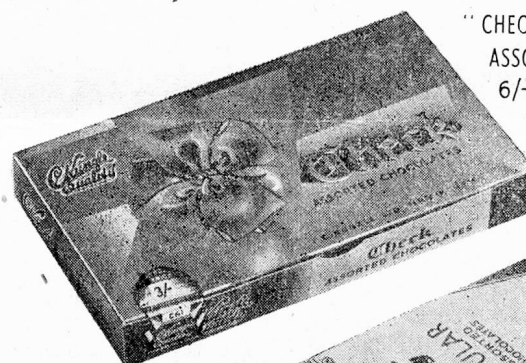
"CHECK" ASSORTMENT 6/- PER LB.