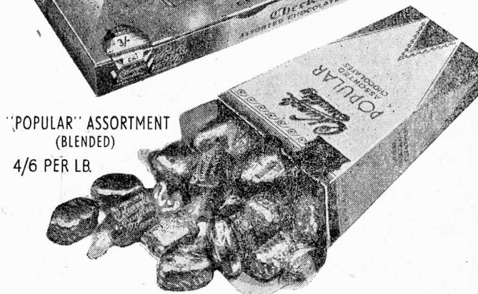
"POPULAR" ASSORTMENT (BLENDED) 4/6 PER LB.