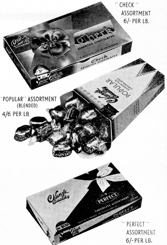
"CHECK" ASSORTMENT 6/- PER LB.