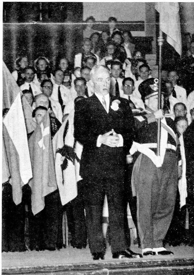
General Guisan speaking at the "Fête Suisse" at Central Hall.