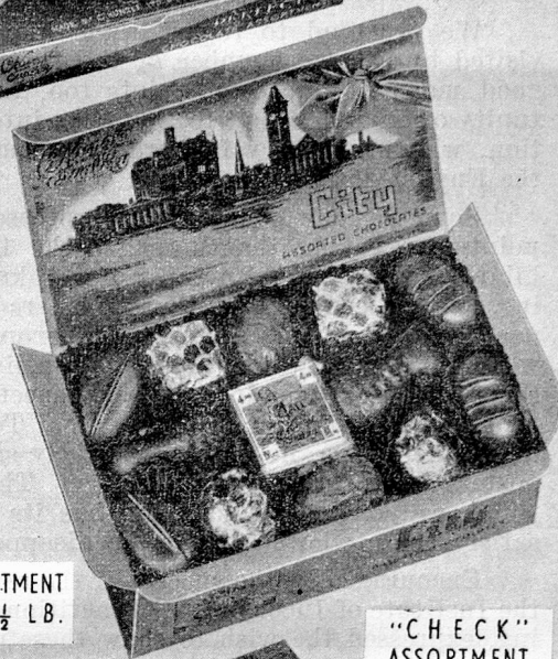
"CITY" ASSORTMENT 2/2 PER 1/2 LB.