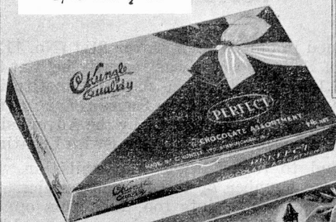
"PERFECT" ASSORTMENT 2/10 PER 1/2 LB.

245 - REGENT STREET - LONDON - W.1. Tel. Grosvenor 8921