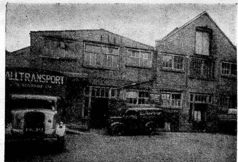
Our Cartage and Receiving Depot in North London

Official Passenger Agents for all Principal Steamship Companies - Official Freight & Passenger Agents for all Air Lines.