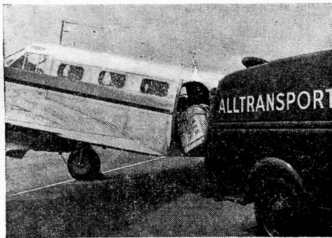
Air Traffic — a Speciality

Official Passenger Agents for all Principal Steamship Companies - Official Freight & Passenger Agents for all Air Lines.