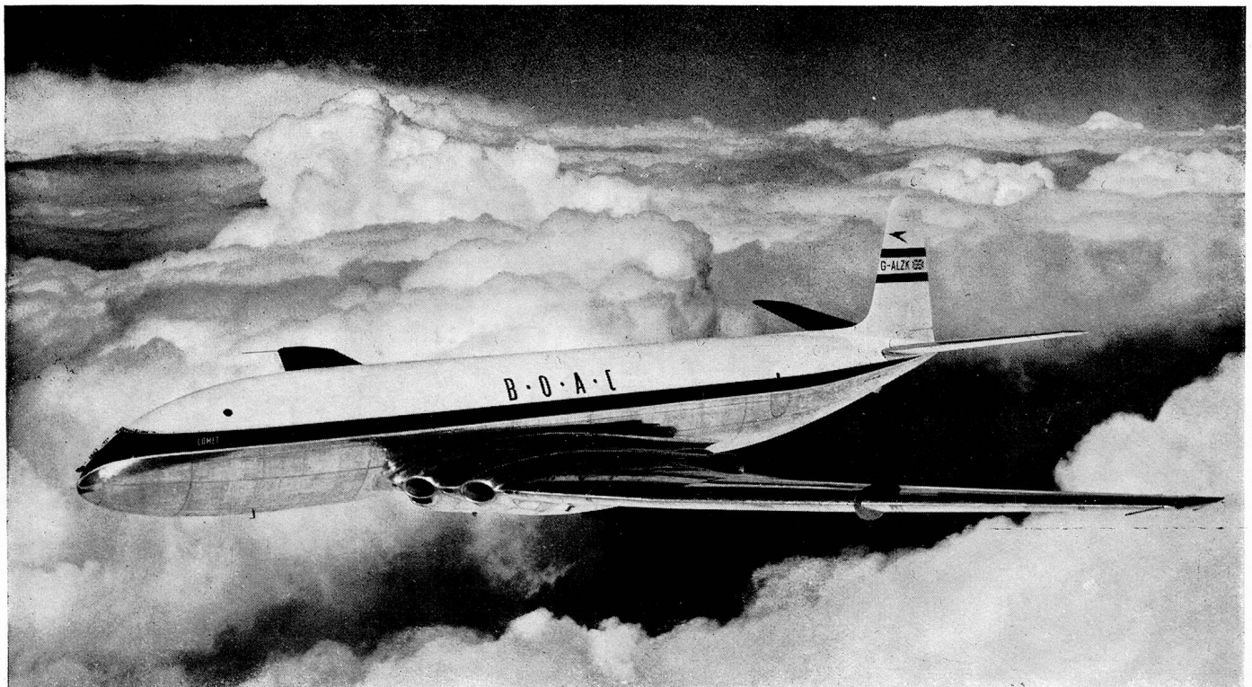
COMET IN FLIGHT.

As with every other aircraft, the engines are kept running for quite a while with the "Comet" whilst the aeroplane is stationary on the ground. The noise which the engines make, sounds from without like a very high, penetrating whistle. Inside the aircraft, however, once the door is closed, the noise is perhaps comparable to the sound of the motor of a vacuum-cleaner. This characteristic noise of the jet-engine has already caused the English public to speak of the "Flying tea-kettle", a reference which needs no explanation but speaks for itself. The actual start, with