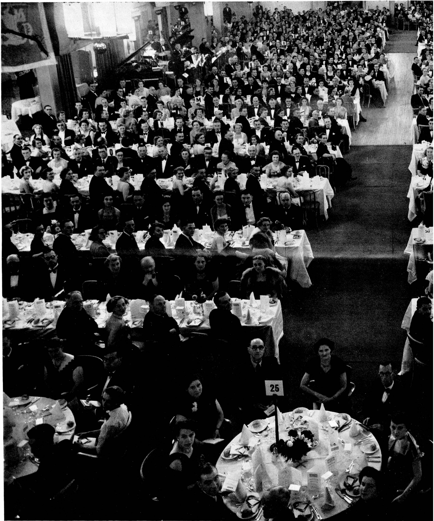
GENERAL VIEW OF