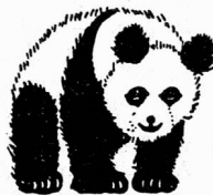
Regd. Trade Mark

... hence their exclusive touch. Where else would you find such a galaxy of checks, spots, stripes and tartans in fine quality Hair Ribbons? ... to mention but a few of the qualities which we weave.