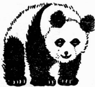
Regd. Trade Mark

Everyone adores them they're so so gay and colourful in a variety of designs:— stripes, spots, checks and tartans. Also self colours in satins, taffetas, failles and petershams. Ask for "Panda" and know you are buying the best.