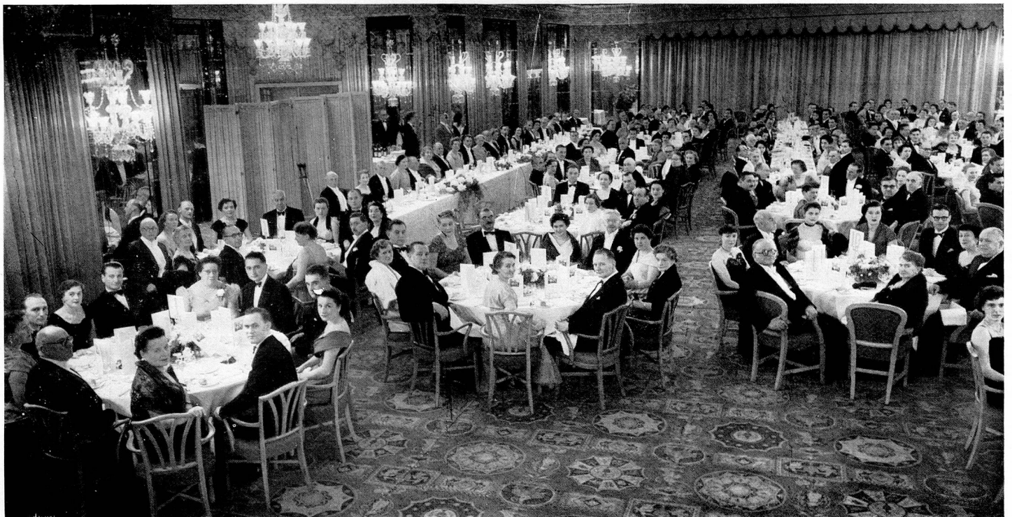
PART VIEW OF THE BANQUETING HALL WITH TOP TABLE.

The President concluded his address by making various comparisons between the citizens of Switzerland and British subjects, which were much enjoyed, commenting on the feeling of superiority the Englishman has, his humour, his lack of appreciation for good cooking, but how these characteristics seem to