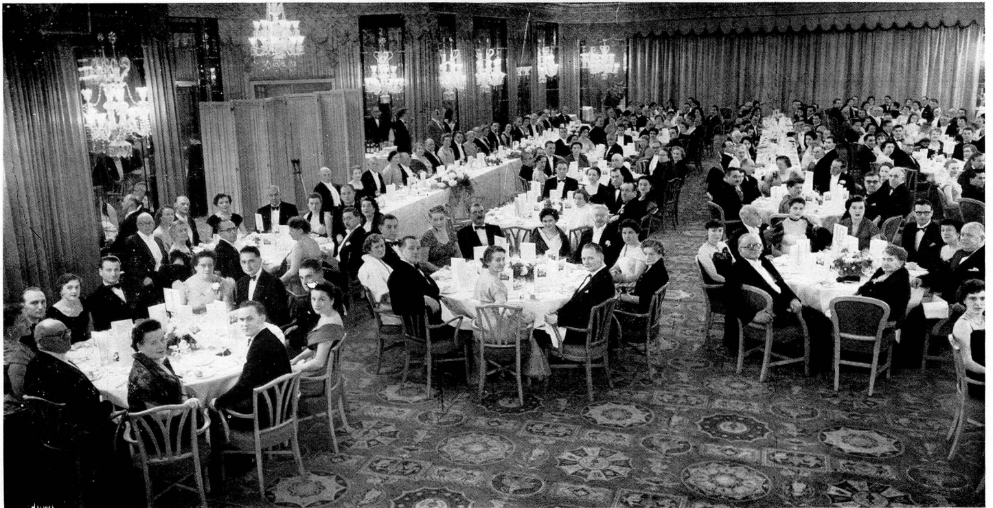
PART VIEW OF THE BANQUETING HALL WITH TOP TABLE.

The President concluded his address by making various comparisons between the citizens of Switzerland and British subjects, which were much enjoyed, commenting on the feeling of superiority the Englishman has, his humour, his lack of appreciation for good cooking, but how these characteristics seem to