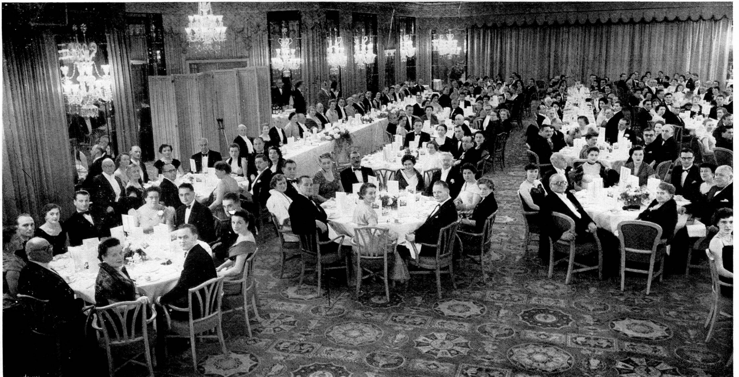
PART VIEW OF THE BANQUETING HALL WITH TOP TABLE.

The President concluded his address by making various comparisons between the citizens of Switzerland and British subjects, which were much enjoyed, commenting on the feeling of superiority the Englishman has, his humour, his lack of appreciation for good cooking, but how these characteristics seem to