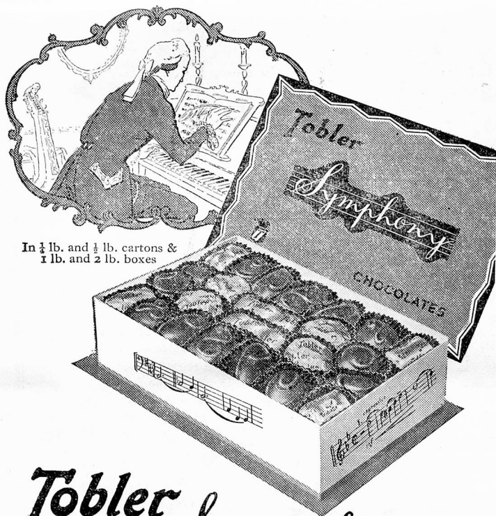
In ½ lb. and ¼ lb. cartons & 1 lb. and 2 lb. boxes