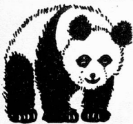
Regd. Trade Mark

. . . because they are made under Swiss management. You will agree when you see the wonderfully gay check, spotted, striped or tartan Hair Ribbons in all widths and colours, and the other fine-quality PANDA lines for millinery, corsetry and tailoring.