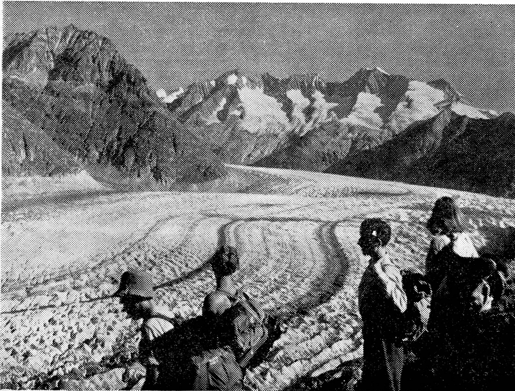
The Aletsch glacier — an atom bomb could turn it into a raging sea.

Unlike heat and blast, radioactivity could strike far