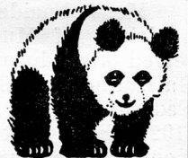
Regd. Trade Mark

Everyone adores them they're so so gay and colourful in a variety of designs:— stripes, spots, checks and tartans. Also self colours in satins, taffetas, failles and petershams. Ask for "Panda" and know you are buying the best.