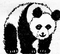
Regd. Trade Mark

Everyone adores them they're so so gay and colourful in a variety of designs:— stripes, spots, checks and tartans. Also self colours in satins, taffetas, failles and petershams. Ask for "Panda" and know you are buying the best.