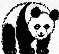
Regd. Trade Mark

Everyone adores them they're so so gay and colourful in a variety of designs:— stripes, spots, checks and tartans. Also self colours in satins, taffetas, failles and petershams. Ask for "Panda" and know you are buying the best.