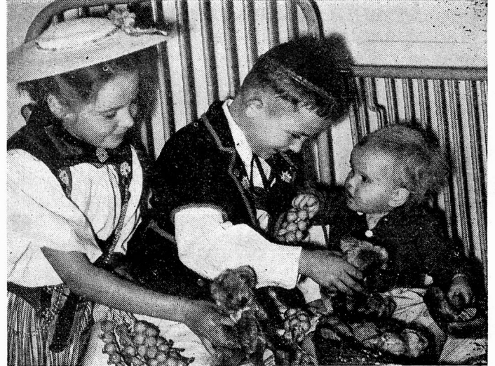
The onions may not be real. And neither are the Bernese bears. But who could wish for nicer presents than these?

The restaurants of course have their own part to play. On the menu: sausage and onion, slices of onion cake, and plenty of onion salad.