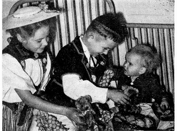
The onions may not be real. And neither are the Bernese bears. But who could wish for nicer presents than these?

The restaurants of course have their own part to play. On the menu: sausage and onion, slices of onion cake, and plenty of onion salad.