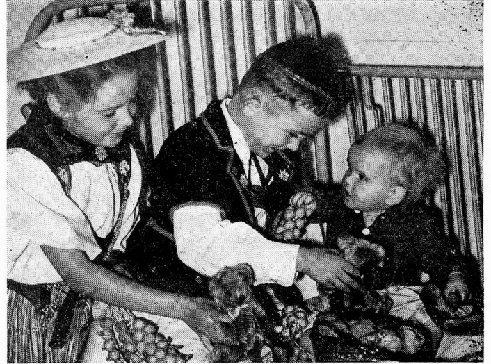
The onions may not be real. And neither are the Bernese bears. But who could wish for nicer presents than these?

The restaurants of course have their own part to play. On the menu: sausage and onion, slices of onion cake, and plenty of onion salad.