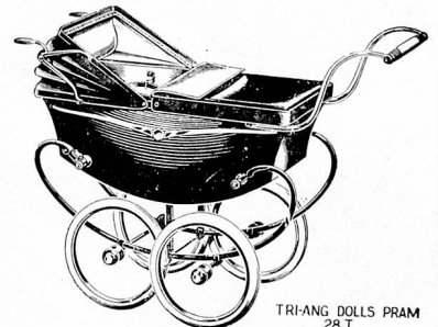
TRI-ANG DOLLS PRAM 28.T

DOLLS-PRAMS TRICYCLES SCOOTERS ROLLER-SKATES