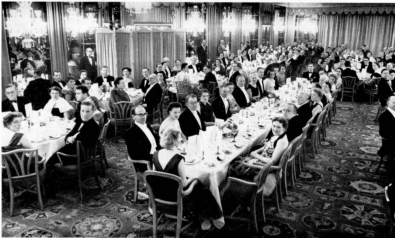
PART VIEW OF THE BANQUETING HALL WITH TOP TABLE.

“When Lord Sempill accepted our invitation”,