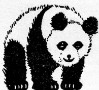
Regd. Trade Mark

Everyone adores them they're so so gay and colourful in a variety of designs:— stripes, spots, checks and tartans. Also self colours in satins, taffetas, failles and petershams. Ask for "Panda" and know you are buying the best.