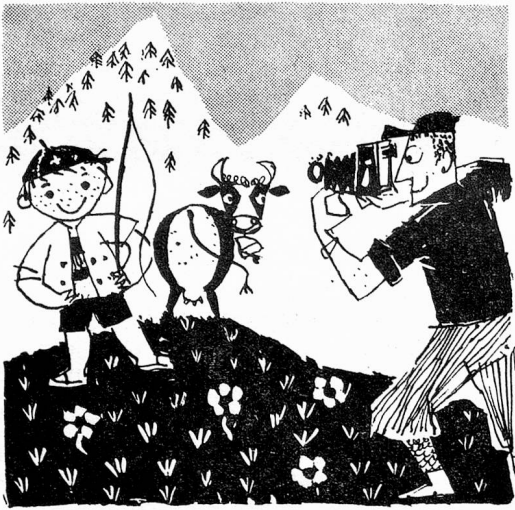
Swiss National Tourist Office, 458, Strand, London, W.C.2