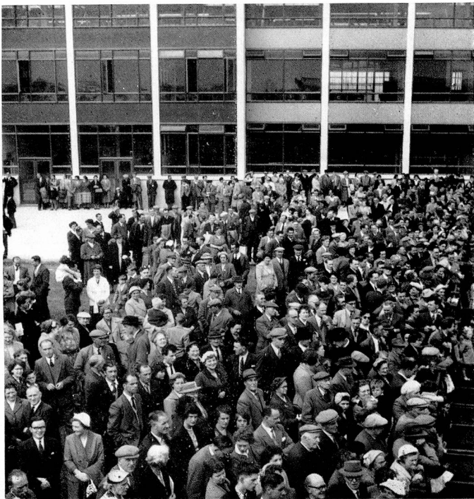
AWAITING THE OPENING.