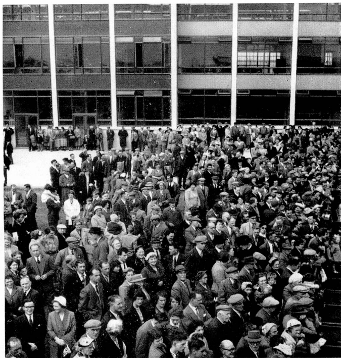
AWAITING THE OPENING.