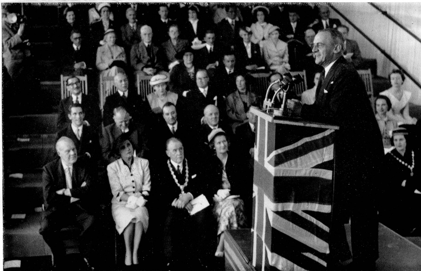
THE SWISS MINISTER GIVING HIS ADDRESS.

This Spring we celebrated in Geneva and in London the first centenary of the coming into force of the Treaty of Friendship, Establishment and Commerce between Switzerland and Great Britain. This treaty is the basis of our relationship; it is a very liberal treaty, embodying in its text the lofty ideals which inspire our peoples; it has been and still is the foundation for a happy mutual expansion of our trade. Such beneficial relations existed, of course, many