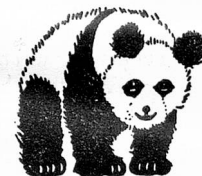
Regd. Trade Mark

Everyone adores them they're so so gay and colourful in a variety of designs :— stripes, spots, checks and tartans. Also self colours in satins, taffetas, failles and petershams. Ask for "Panda" and know you are buying the best.