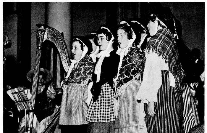
Welsh schoolgirls in ancient costumes give a good sample of excellent choral singing.

The Swiss reciprocated the treat with a film show, giving the audience a true-to-life glimpse of their country's many natural beauties. Later, characteristic presents were exchanged. The Lord Mayor of Cardiff, first citizen of Europe's youngest capital, was given a wooden bear — suitable greeting from Berne, ancient capital city of Switzerland. He, in turn, presented the Swiss Ambassador with a beautifully carved traditional Welsh "loving spoon", an