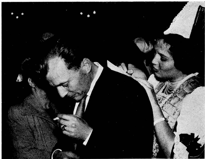
In an atmosphere of informal friendliness autographs and addresses are exchanged.

In his reply, the Swiss Minister expressed the hope that one day Merthyr Mawr will grow into an internationally famous resort.