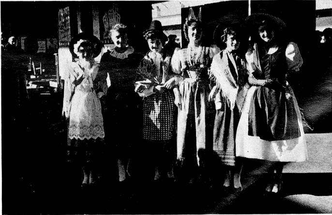
Swiss and Welsh national costumes make a charming picture outside Cardiff station.

A warm reception was given to the delegation at Cardiff station; three young girls in Welsh costume added colour to the scene.