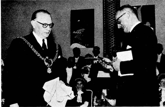
A carved loving spoon is presented to the Swiss Minister by the Lord Mayor of Cardiff.

The evening ended on a note of informal friendliness. Autographs and addresses were exchanged, Welsh hosts and Swiss guests had plenty to chat about. In the background, the gleaming skis stood guard — promising links between Swiss snow and Welsh sand.