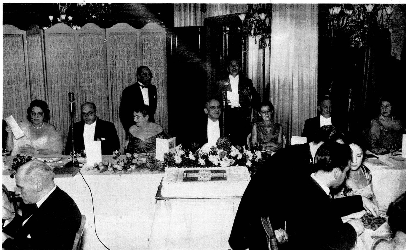
A PART OF THE TOP TABLE.